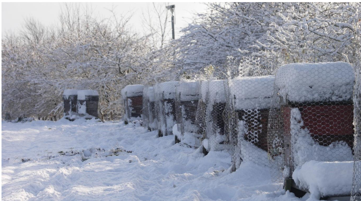
Chicken wire placed around the hive to serve as woodpecker protection.