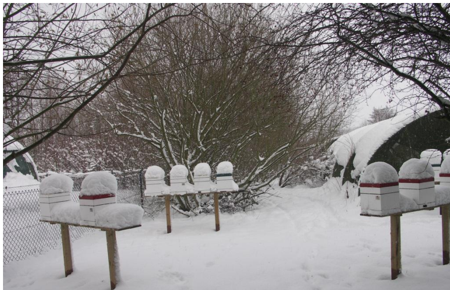
Overwintering queens in mini plus mating hives.

Check each colony for signs of brood and adult bee diseases. Remedial action or culling should be undertaken as appropriate. If the disease found or suspected is statutorily notifiable, i.e. European or American Foul Brood, you must inform your local Bee Inspector or the National Bee Unit. Beekeepers should know the signs of these diseases and inspect colonies for foul brood and other bee diseases throughout the season, as a minimum specifically once in the spring and once in the autumn. If colonies are small, find out why. If they are pest and disease free they can be united and re-queened. If diseased, remedial action can be taken, but culling may be a better option. Further information about brood diseases can be found in the NBU leaflet 'Foul Brood Disease of Honey Bees and other common brood disorders'.